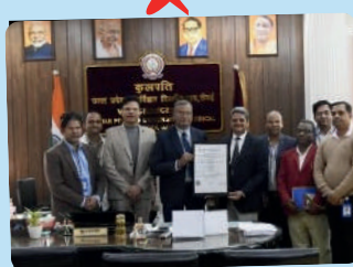
Under the leadership of Vice-Chancellor, UPUMS Saifai's Central Laboratory has received NABL accreditation. Granted under ISO 15189:2022, this ensures high-quality, accurate, and reliable diagnostic services.