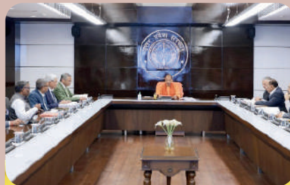
Under the chairmanship of Hon'ble Shri Yogi Adityanath Ji, the Board of Governors of Uttar Pradesh University of Medical Sciences approved key public welfare initiatives. These encompass the establishment of a trauma centre, strengthening of rural healthcare, promotion of integrative medicine, and initiation of a community broadcast service.